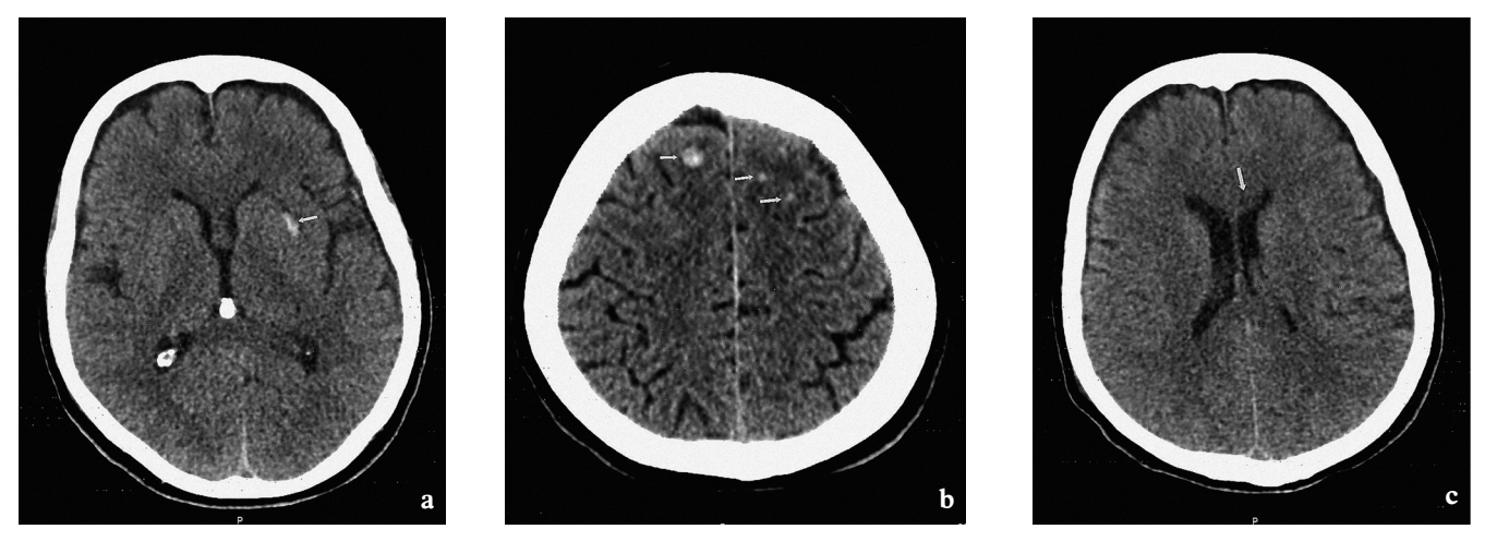
Figure 1. Axial CT, day of injury (DOI). Small hemorrhagic focus in left subinsular region – arrow (a) and at the level of the centrum semiovale in the left and right frontal subcortical white matter – arrows (b). Hypodense lesion in genu of corpus callosum is not well seen in CT – arrow (c).

The aim of this paper is the presentation of the clinical image of DAI and the emphasis of the diagnostic importance of MRI in the diagnosis of this neurological condition.